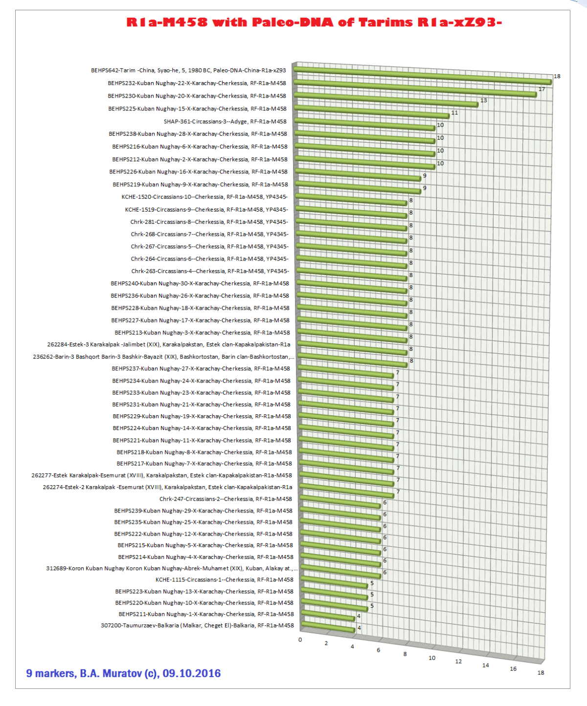
Diagramma 1. Comparison haplotypes of R1a-M458 with Tarim paleo-DNA R1a-xZ93-

When compare with the Tarim Paleo-DNA R1a-xZ93- ^3 , was revealed, that the closest to the Tarim Paleo-DNA from of Nogais R1a-M458 is haplotype #BEHPS232, because at the 9 markers, he had only one step-mutation unlike Tarim Paleo-DNA. But given the a little total markers of the Tarim Paleo-DNA, clearly attributed to the Tarim Paleo-DNA to the R1a-M458 subclade — is not possible.